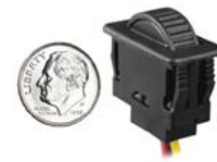
HTWS : Smaller Proportional Output Thumbwheel