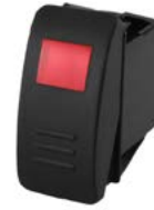
K5 : Sealed Illuminated Rocker