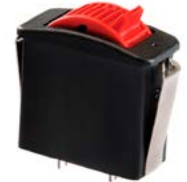
HTWE : Hall Effect Friction Actuation Thumbwheel