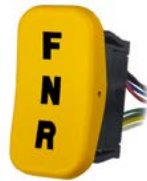
K1S : Sealed ON-ON Triple Throw Rocker