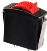
HTWE: Hall Effect Friction Actuation Thumbwheel