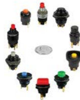
P7: Subminiature MIL-PRF-8805/110 Pushbutton