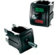
K4 : Sealed Snap-In Rocker