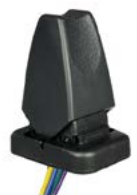
HPW : Hall Effect Single Axis Paddle