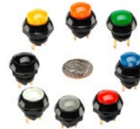
P7-D / P9 : Sealed Momentary Action Pushbutton