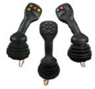
G3 : Contour Grip