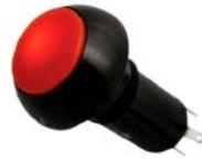
LP3 : Illuminated Sealed Momentary Action Pushbutton