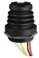
HTLT2: 2-Way Finger Joystick with Pushbutton Option