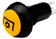
LP5: Illuminated Alternate Action Pushbutton