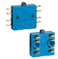
B5-7 : Double Break Miniature Basic Switches