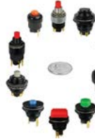
P7: Subminiature Sealed Pushbutton