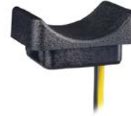
CS: Capacitive Touch Switch