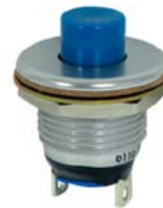
P8: Momentary Sealed Subminiature Pushbutton