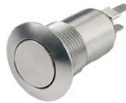
P5-V: Vandal Resistant Sealed Alternate Action