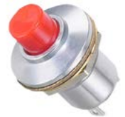
P3: Sealed Momentary Action or Push-Pull Button