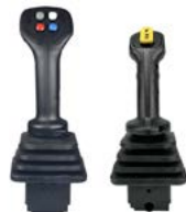
HJLG3-C / HJLG3-M : JHL Joysticks with G3-C / G3-M Grips