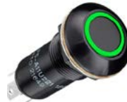
LP5-V : Vandal Resistant Alternate Action Pushbutton