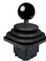
JHL: Cost Effective Sealed Joystick