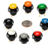
P7-D / P9: Sealed Momentary Action Pushbutton