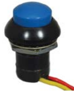
HP7 : Hall Effect Momentary Pushbutton