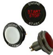
LP30M : Large Sealed Illuminated Pushbutton