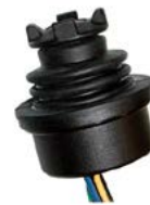
HTL2 / HTL4 : 2-Way and 4-Way Single Axis Linear Finger Joysticks