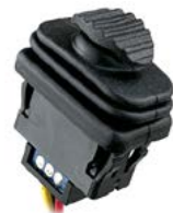
HTWS : Thumb Paddle Wheel with Seal Boot