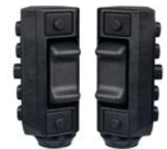
G3-E : Control Grip