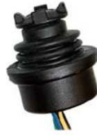
HTL4: 4-Way Single Axis Linear Finger Joystick