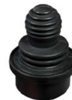
HTL4: 4-Way Single Axis Linear Finger Joystick