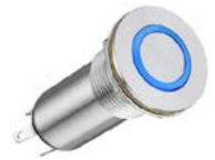
LP3V : Ring Lit Vandal Resistant Pushbutton