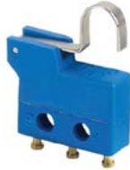
B2-5: Single Break Subminiature Basic Switch with Levers