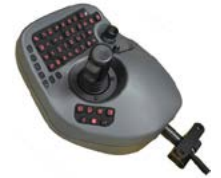
WP: Operator Control Module