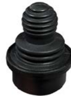
HTL4: 4-Way Single Axis Linear Finger Joystick