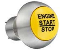
P3-D: Sealed Momentary Action Pushbutton