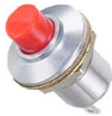
P3 : Sealed Momentary Action Pushbutton