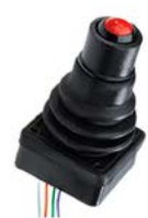
JHT: Miniature Joystick