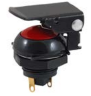
FG : Flip Guards