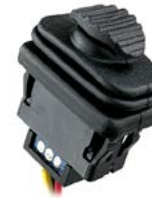
HTWS: Thumb Paddle Wheel with Seal Boot