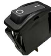
K1: Sealed Rocker