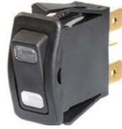
K1 : Sealed Rocker